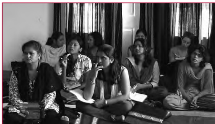
Participants at the Kathmandu workshop on cross-border surrogacy arrangements.

This is why groups like Sama and WOREC are advocating